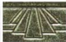
PC-48 [O] [T] Art Deco Green