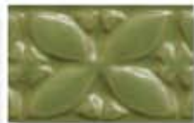
PC-46 [O] [T] Lustrous Jade