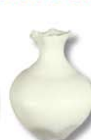
HF-17 [TL] [T] Waxy White