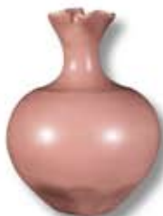
HF-52 [O] [T] Hazy Pink