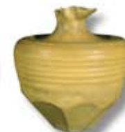
HF-32 [O] [T] Textured Tan