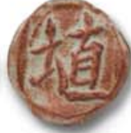
SH-42 [O] [T] Oolong Matte