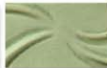
PC-49 [O] [T] Frosted Melon

[O]=Opaque [TP]=Transparent [TL]=Translucent [ST]=Semi-Translucent [SO]=Semi-Opaque