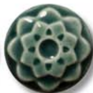
C-22 [TP] [T] Fog