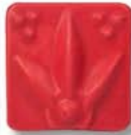
SM-51 [O] [T] Red