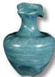
HF-24 [O] [T] Teal Blue