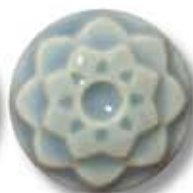
C-23 [TP] [T] Ice