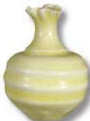
HF-60 [TP] [T] Yellow