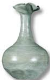
HF-18 [O] [T] Gray