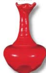
HF-55 [TL] [T] Coral Gloss