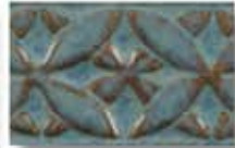
PC-20 [O] [T] Blue Rutile