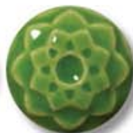
C-43 [TP] [T] Wasabi