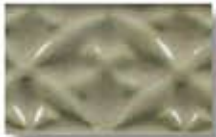
PC-43 [O] [T] Toasted Sage