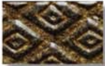
PC-30 [O] [T] Temmoku