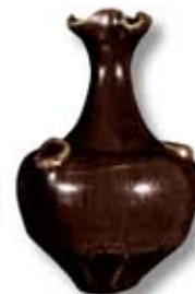
HF-31 [TL] [T] Rust Brown