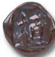
SH-21 [O] [T] Acai Gloss