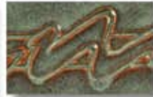
PC-33 [O] [T] Iron Lustre