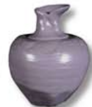
HF-54 [O] [T] Purple