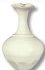
HF-10 [TP] [T] Clear