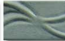
PC-28 [O] [T] Frosted Turquoise