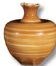
HF-30 [TP] [T] Brown