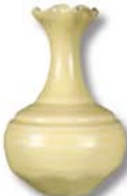
HF-63 [O] [T] Textured Almond