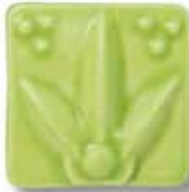
SM-42 [O] [T] Mint