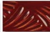
PC-59 [TP] [T] Deep Firebrick