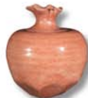
HF-51 [O] [T] Peach