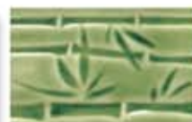
PC-40 [TP] [T] True Celadon