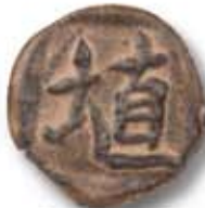
SH-32 [O] [T] Cacao Matte