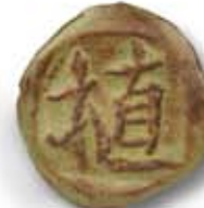
SH-46 [O] [T] Matcha Matte