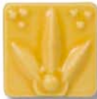
SM-63 [O] [T] Yellow