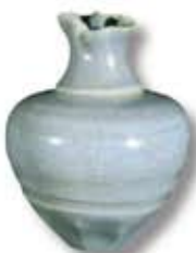
HF-22 [O] [T] Textured Blue