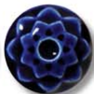
C-20 [TP] [T] Cobalt