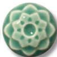
C-40 [TP] [T] Aqua