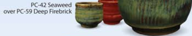
PC-42 Seaweed over PC-59 Deep Firebrick