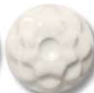
C-10 [TP] [T] Snow