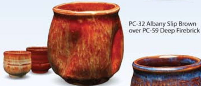
PC-32 Albany Slip Brown over PC-59 Deep Firebrick