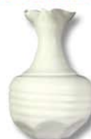
HF-13 [O] [T] White Matt