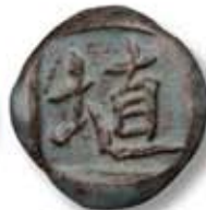
SH-22 [O] [T] Acai Matte