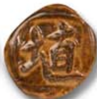
SH-31 [O] [T] Cacao Gloss