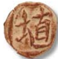
SH-12 [O] [T] Chai Matte