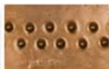
PC-2 [O] [T] Saturation Gold