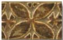
PC-61 [O] [T] Textured Amber