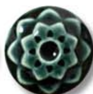
C-49 [TP] [T] Rainforest