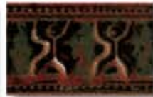
PC-53 [O] [T] Ancient Jasper