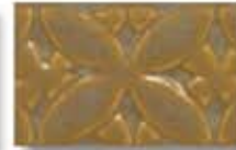
PC-39 [O] [T] Umber Float