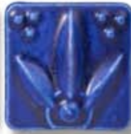
SM-21 [O] [T] Dark Blue