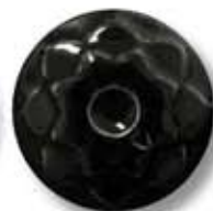
C-1 [TP] [T] Obsidian