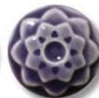
C-56 [TP] [T] Lavender