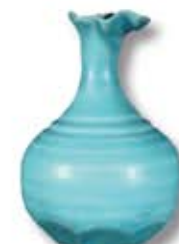
HF-26 [O] [T] Turquoise

[O]=Opaque [TP]=Transparent [TL]=Translucent Only glazes marked with the spray symbol may be used for safe spray application.