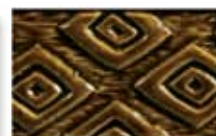
PC-35 [O] [T] Oil Spot