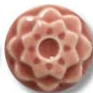
C-50 [TP] [T] Cherry Blossom