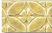
PC-31 [O] [T] Oatmeal