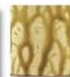
PA-60 [T] Tan