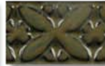
PC-36 [O] [T] Ironstone