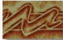
PC-32 [O] [T] Albany Slip Brown