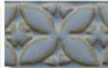
PC-21 [O] [T] Arctic Blue