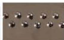
PC-4 [O] [T] Palladium