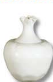
HF-11 [O] [T] White