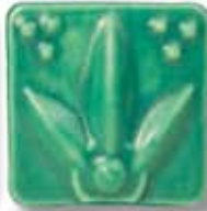
SM-27 [O] [T] Teal