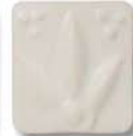
SM-11 [O] [T] White