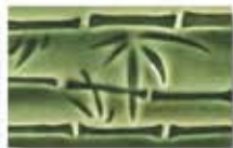
PC-45 [TP] [T] Dark Green