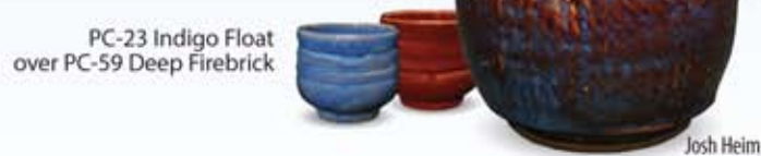
PC-23 Indigo Float over PC-59 Deep Firebrick