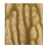
PA-30 [T] Brown