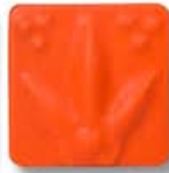
SM-68 [O] [T] Orange