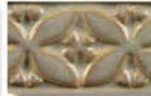
PC-34 [O] [T] Light Sepia