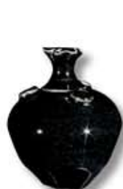
HF-1 [O] [T] Black