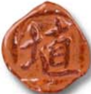
SH-51 [O] [T] Hibiscus Gloss