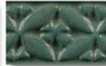
PC-27 [O] [T] Tourmaline