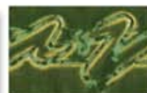
PC-41 [O] [T] Vert Lustre