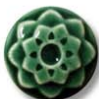
C-47 [TP] [T] Jade