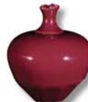
HF-56 [TL] [T] Red Gloss