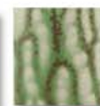
PA-40 [T] Green

[O]=Opaque [TP]=Transparent [TL]=Translucent [ST]=Semi-Translucent [SO]=Semi-Opaque