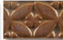
PC-37 [O] [T] Smoked Sienna