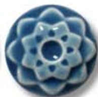
C-21 [TP] [T] Sky