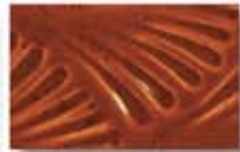
PC-52 [TP] [T] Deep Sienna Speckle