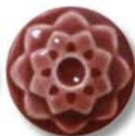
C-53 [TP] [T] Weeping Plum