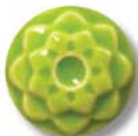
C-41 [TP] [T] Pear