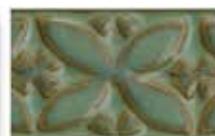
PC-25 [O] [T] Textured Turquoise