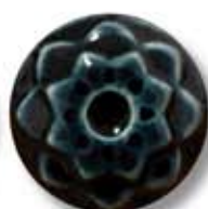
C-27 [TP] [T] Storm