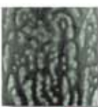
PA-1 [T] Black