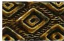
PC-62 [TP] [T] Textured Amber Brown