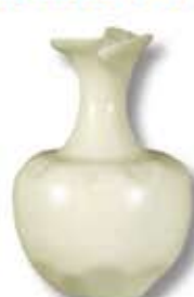
HF-12 [TP] [T] Clear Satin