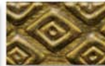
PC-60 [TL] [T] Salt Buff