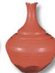
HF-57 [O] [T] Coral Matt