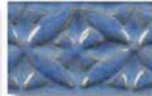
PC-23 [O] [T] Indigo Float