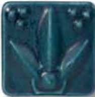
SM-29 [O] [T] Blue Green