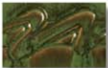
PC-42 [O] [T] Seaweed