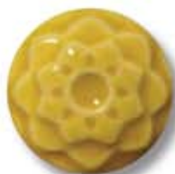
C-60 [TP] [T] Marigold