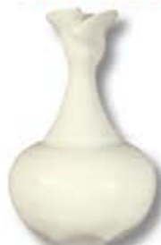
HF-9 [TP] [T] Zinc-Free Clear