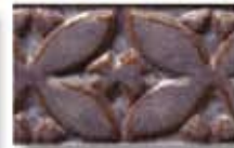
PC-57 [TL] [T] Smokey Merlot