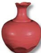
HF-58 [O] [T] Red Matt