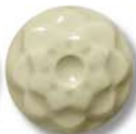
C-11 [TP] [T] Mixing Clear