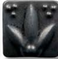
SM-1 [O] [T] Black