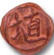
SH-52 [O] [T] Hibiscus Matte