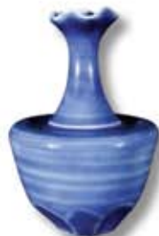
HF-21 [TP] [T] Ultramarine Blue