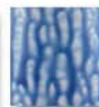
PA-20 [T] Blue