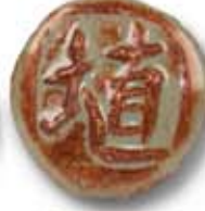
SH-41 [O] [T] Oolong Gloss