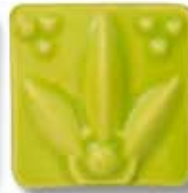
SM-44 [O] [T] Chartreuse