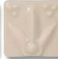
SM-10 [O] [T] Clear Satin