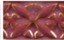
PC-55 [O] [T] Chun Plum