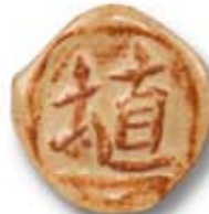
SH-11 [O] [T] Chai Gloss