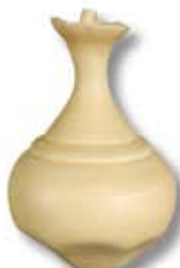
HF-62 [O] [T] Matt Yellow Oatmeal