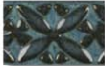
PC-12 [O] [T] Blue Midnight