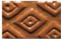
PC-50 [TL] [T] Shino