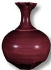
HF-50 [O] [T] Glossy Burgundy