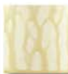
PA-15 [T] Buff