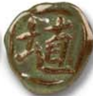
SH-45 [O] [T] Matcha Gloss