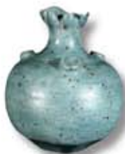
HF-23 [O] [T] Textured Gray Blue