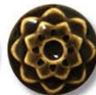
C-36 [TP] [T] Iron