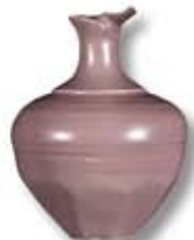
HF-53 [O] [T] Lavender