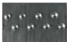
PC-1 [O] [T] Saturation Metallic