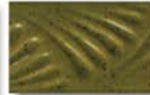
PC-29 [TP] [T] Deep Olive Speckle